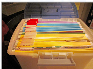
When there is a large amount of assets, we organize and create an inventory.