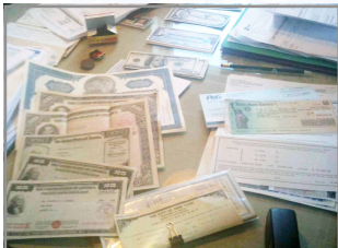
Homes filled with contents from multiple generations can mean forgotten assets.